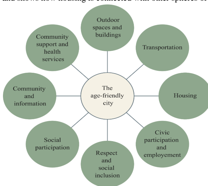
Fig. 2. WHO model of Age-Friendly Cities in 2007 [9; 21]

The results stress that engaging older people in the design of age-friendly housing initiatives is crucial, resulting in the creation of solutions preferred by users. This is why our review focused on the need to involve the community in the construction of age-friendly housing. Studies such as [19; 20] stressed that the participation of older adults in planning and design processes leads to more effective and acceptable housing solutions. Fig. 2. presents the WHO model of Age-Friendly Cities and the domains within which the different components of an age-friendly environment are situated. This model guides our reasoning and shows how housing is connected with other spheres of urban existence.